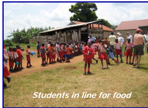
Students in line for food

To learn more about KidsUganda, visit www.KidsUganda.com .